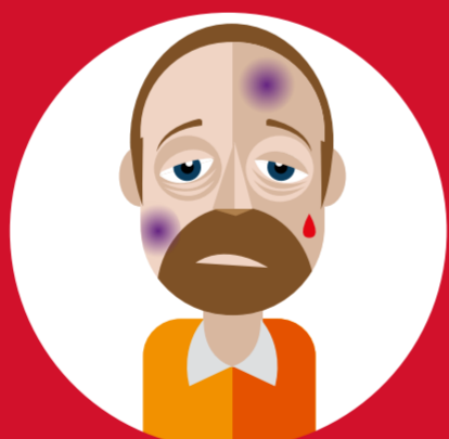
Easy bruising or bleeding