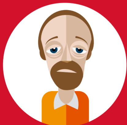
Unexplained weight loss (without trying)