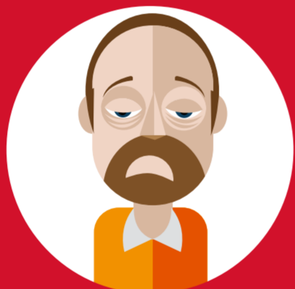
Feeling tired most of the time