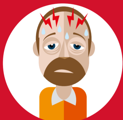
Fever and night sweats