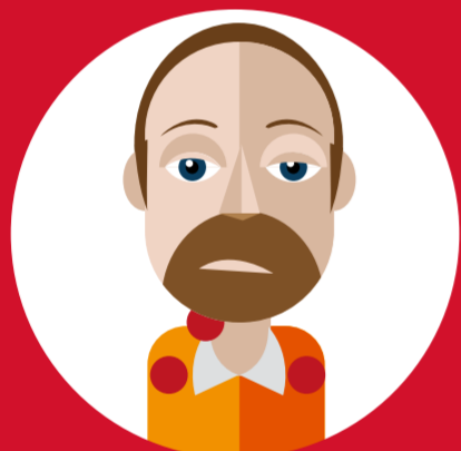
Painless swelling of the lymph nodes in the neck, underarm, stomach or groin

Leukemia symptoms vary, depending on the type of Leukemia. Common Leukemia signs and symptoms include: